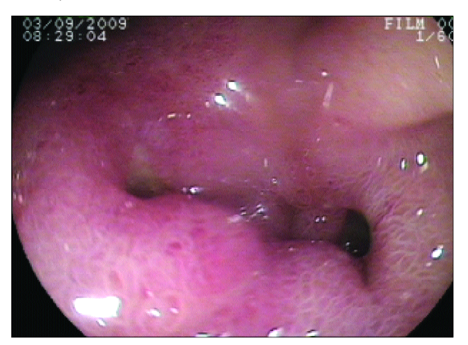
Figure 3. Endoscopic imaging of ulcer on the anterior wall of bulbus

In addition; Lopes et al. (8) speculated that local protease activation at sites of pulmonary vascular injury may account for abnormal degradation of vWF and possibly other proteins.