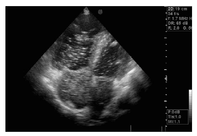
Figure 2. Contrast echocardiography demonstrating right-to-left shunt

In patients with atrial septal defect, blood initially shunts from the systemic to the pulmonary circulation, and if the defect is large and the left-to-right shunting is sustained,