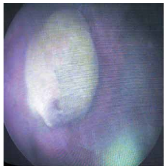
Figure 2. Polypoid mass on the right lateral wall of the nasopharynx