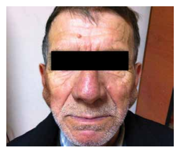
Figure 1. Left and right parotid masses