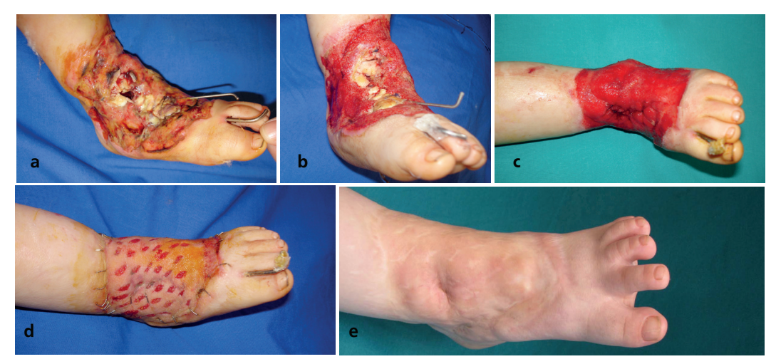
Figure 3. (a) Three years old boy, the wound located on the dorsum of the left foot and ankle as a result of a traffic accident. View of a 10x5 cm defect with exposed tendon on the base of the wound. (b) View of the defect after debridement and bone stabilization. (c) The surface of the tendons were completely covered by granulation tissue. (d) The defect was reconstructed with skin grafts. (e) View of the defect in the second year postoperative. There were no complications

The positive effect of NPT on wound healing is due to multiple factors. With NPT, excess wound exudate, which contains factors that inhibit fibroblasts, endothelial cells, and keratinocytes are removed from the site (4,6). Also, the edema surrounding the wound decreases with NPT and with this decrease, the blood vessels around the wound dilate and the blood flow to the wound increases. Herscovici et al. (1) determined that over 500 cc of fluid is taken from the tissues in the first 24 hours in NPT applications after high-energy trauma. The increase