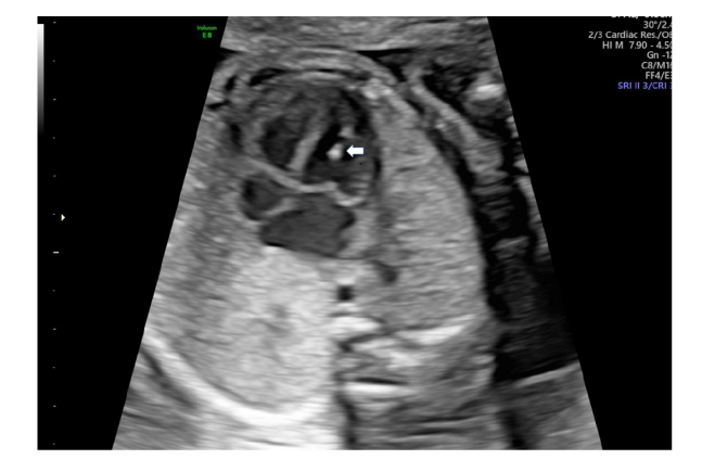
Figure 1. A representative ultrasound image of fetal echogenic intracardiac (arrow) focus in the left ventricle

Table 1 presents the baseline clinical characteristics of the study population. In the study population, there were 105 participants with EIF and 101 participants without EIF. The median age of the women with and without EIF was found to be similar (p=0.583). The study groups were found to be comparable regarding the median gravidity value (p=0.770). There was no significant difference in the median parity of study groups (p=0.382). The mean body